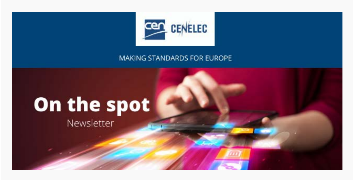
Issue 22 • March 2021