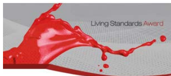
Living Standards Award 2019

Year's reception on 24th January 2019 in Vienna. The winning projects have been selected by a high-calibre international jury of experts based on their exemplary utilization of standards, the development of standards and strategic considerations related to standards.